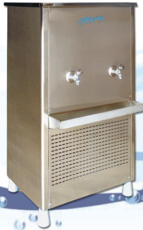
FSS - 150/150