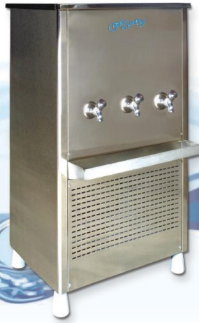
FSS - 200/200