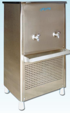
FSS - 40/80, 80/80