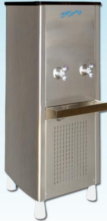
FSS - 20/40, 40/40