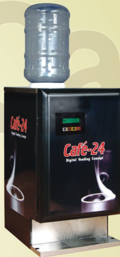
2 OPTION (HOT)