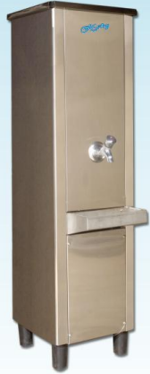
FSS - 20/20