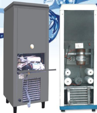
Space provided for RO system installation in FSS Coolers & Mega