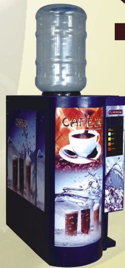
2 OPTION (COLD)