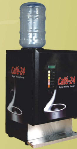
4 OPTION (HOT)