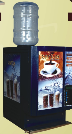
4 OPTION (HOT & COLD)