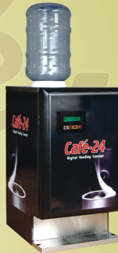
3 OPTION (HOT)