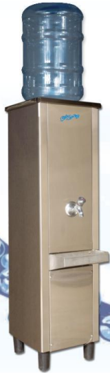
FSS - 20/20 (Bubble Top)