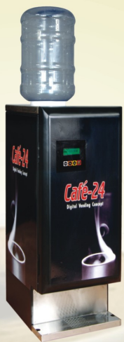
1 OPTION (HOT)